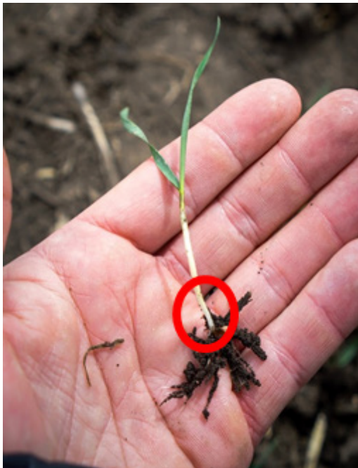
Figure 2: Wheat seedling with a healthy growing point

If you find a large number of plants that haven't survived, you will want to assess your plant population and determine if action needs to be taken.