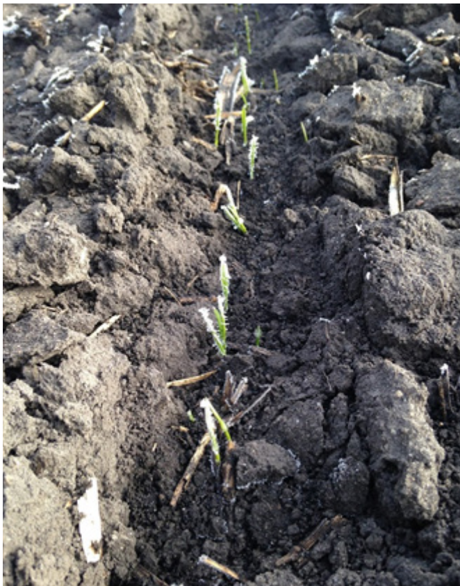
Figure 1: Emerged wheat seedlings with frost crystals.

When emerged cereal crops experience night-time temperatures below 0°C, the question of crop survival is never far from a producer's mind. In general, wheat is relatively resilient to frost as compared to crops like canola. Wheat leaves can survive air temperatures down to -8°C to -10°C, however, leaves may see some leaf tip burn. This is indicated by recent research investigating ultra-early seeding of CWRS wheat (Collier et al., 2021). Barley is less resilient and will exhibit frost damage at temperatures closer to -4°C to -6°C (R. McKenzie, personal communication). Minimal frost tolerance research on barley has been conducted. However, the chance of plant death is low at these temperatures, especially when soil temperatures are warmer. Warmer soil, and especially moist soil, is buffered from temperature changes which helps to protect the growing point of cereals from late spring frost. This is due to wheat and barley plants having their growing point under the soil surface until stem elongation (begins after the three-leaf stage and tiller initiation) when the