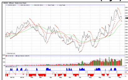
KC Dec. '20 Wheat