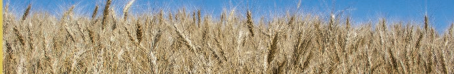
Figure 2. Relative differences in crop sensitivity to imidazoline based herbicide carryover